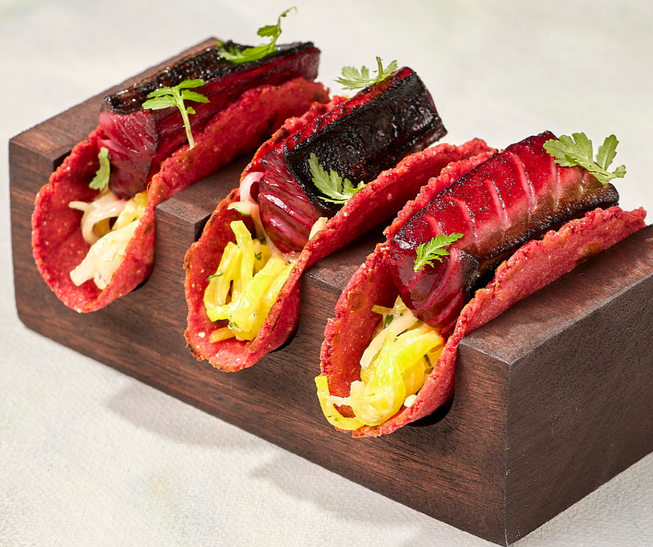
TACO HOLDER F86009 3 Slot - Rubio Monocoat